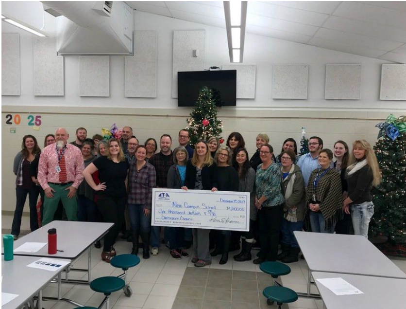
New Campus School staff Special to the Record-Eagle